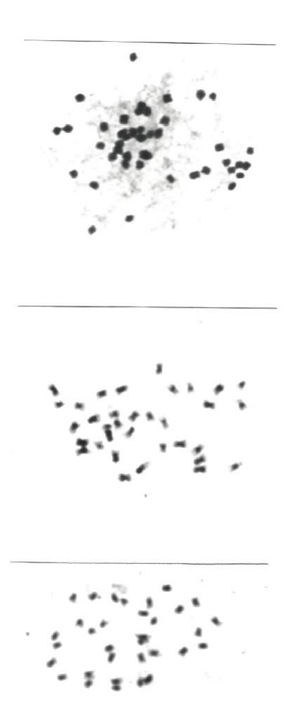
Figure 2. Mitotic metaphase plates showing 44 chromosomes in "Nzizi" (a) and 33 chromosomes in 'Too' (b) and 'Toowoolee' (c).

by different cytotypes. This can only be confirmed by looking at a large number of accessions from the whole geographical range of these genotypes.