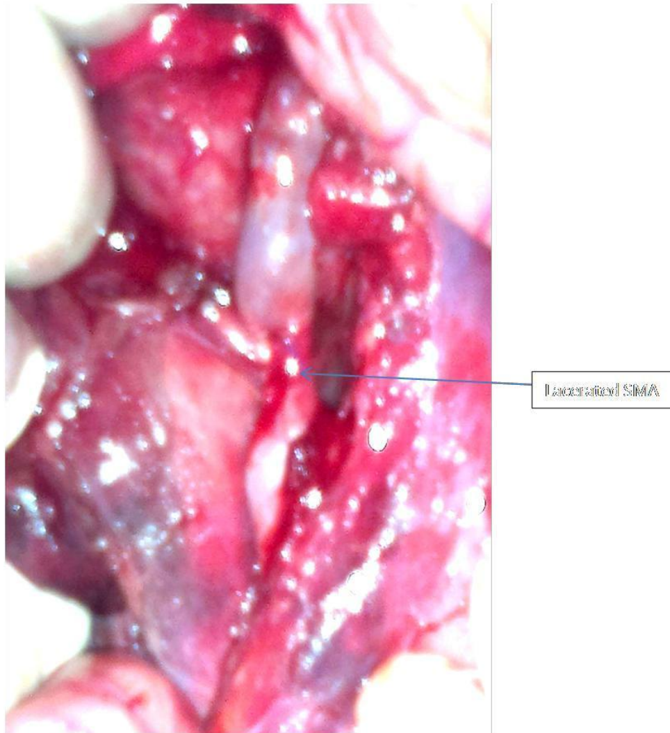
Figure 3. Lacerated superior mesenteric artery.

performed in our cases under study. CT scan is a good investigative modality in elective cases or if patient's haemodynamic condition permits for these investigations. Duodenal injuries in both first and third part of duodenum was encountered, with significant right retroperitoneal haematoma. The study's technique of management, not yet reported in practical practice, has been associated with a successful outcome with no postoperative complications encountered.