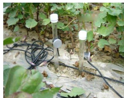
Figure 2. TS-2 negative pressure meter to measure soil water potential in the cotton field.

Data is collected by three pathways in the information system. The first pathway according to the feature and request for the parameters measured by the meter, the data is automatically input into the software at the time-boxed everyday. For example, soil water potential data is input into the information system at am 9:00 daily. In the second pathway, the data is input by setting the time interval, in order to satisfy with some requests for the