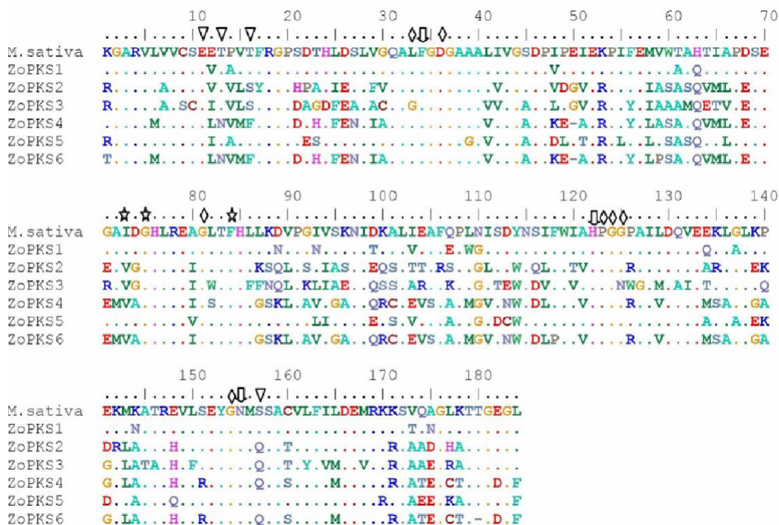
Figure 1. Comparative analysis of PKS family from Z. officinale with CHS from M. sativa . The nucleotide sequence were translated to corresponding amino acid sequence and was used for the comparison. This region corresponds to the 182-366aa region of typical PKS. The amino acid residues forming the active site (↓), substrate binding pocket (○), cyclisation pocket (☆) and pocket to shape the active site (▽) are shown in the alignment.

compared to the typical reaction where coumaroyl and malonyl units is used as the substrates.