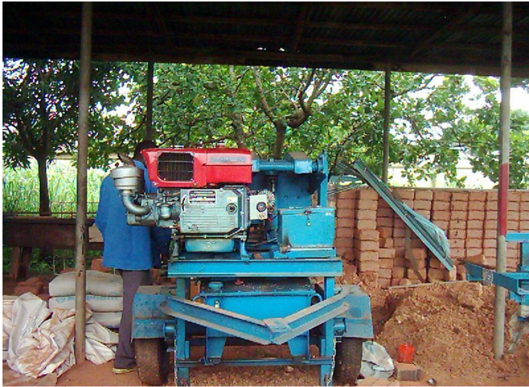
Figure 1: Hydraulic Machine developed by NBRRI, Lagos.

pollutants; to reduce the use of energy; to cut down the use of natural resources (including water); and to minimize the amount of waste generated. One of the effective ways to deal with negative environmental impact of concrete is to reduce the total volume of this material needed for a certain construction process by enhancing its performance (Joseph, 2010).