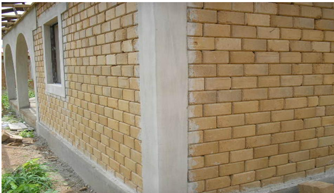
Figure 3: Interlocking Masonry at the Finishing Stage of a Housing Project.