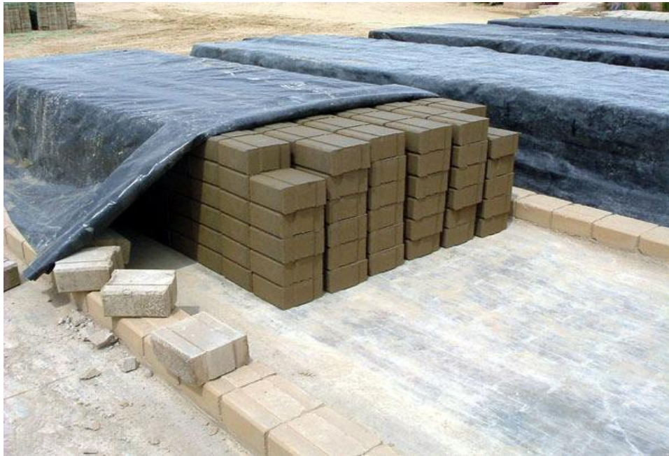
Figure 2: Stacking of Solid Interlocking blocks.