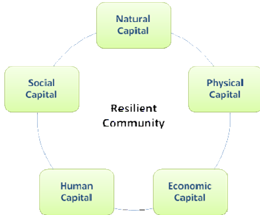
Figure 2. Elements of a resilient community.