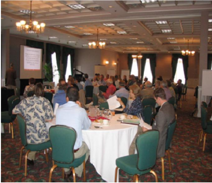
Figure 3. Design Charrette at Galveston.