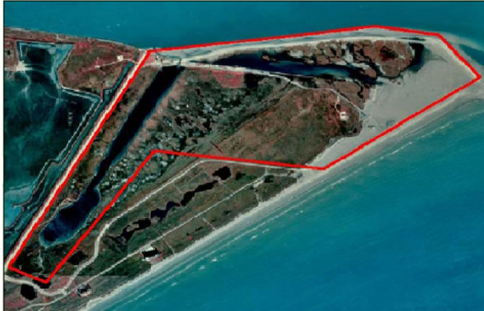
Figure 4. Aerial view of the East Lagoon Nature Park.