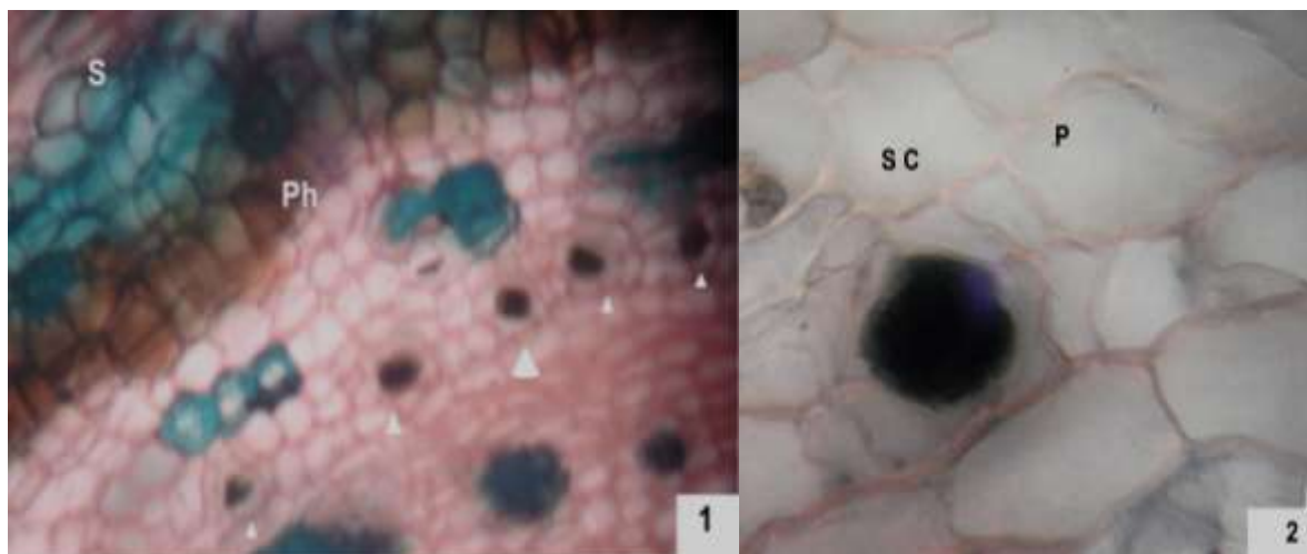
Figures. 1.2. Anatomic structure of outer part containing a circle of secretor canals in transverse sections of root of Cnicus benedictus L. Bar = 20 \mu m. Figs shows (S=Suber; Ph= Phelloderma, P = Parenchyma, SC= Secretary canals. Bars = 80 \mu m).