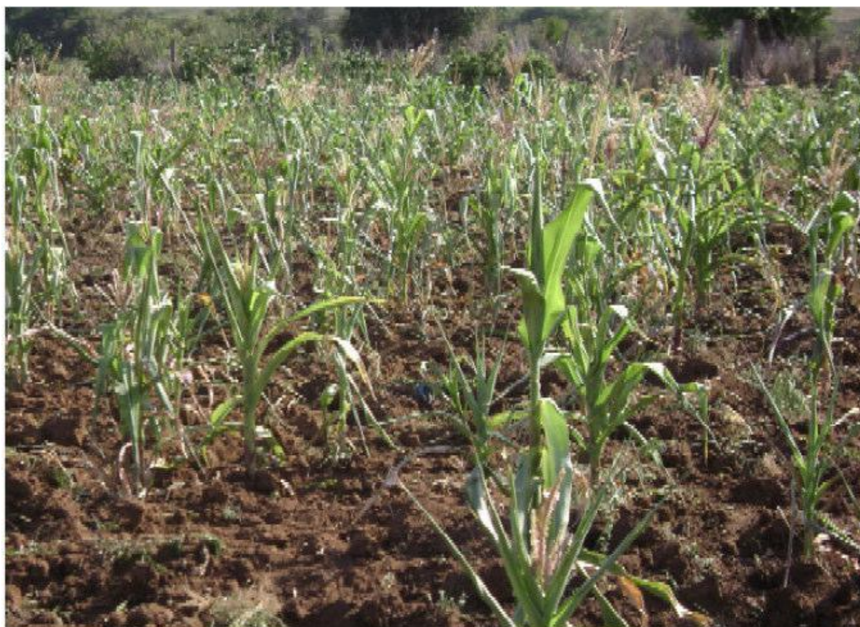
Plate 1. Stunted maize crop: maize crop tussling at knee high as a result of moderate drought.