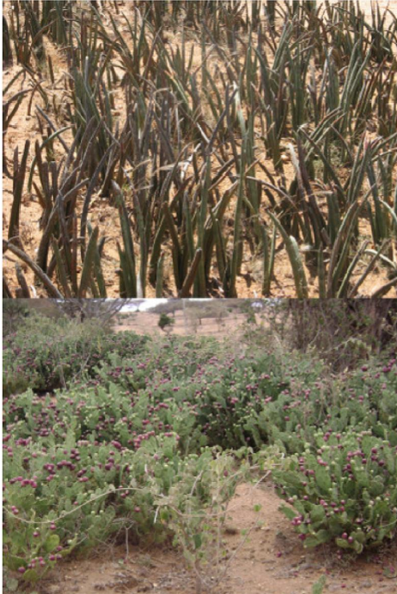
Plate 2. Sections of rangeland encroached by non-palatable Oldupai ( Sansavellia sp) and prickly pear ( Opuntia megacantha ) plants (Source: Field data, 2008).

agricultural activities such as charcoal burning and sand harvesting that degraded their immediate environment. The end result has been a vicious cycle of food insecurity, inter-tribal conflicts, cattle rustling, environmental degradation and dependency on relief food.