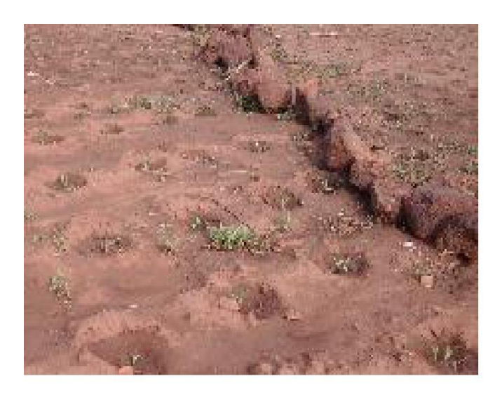
Figure 2. Stone row combined with zaï pits.