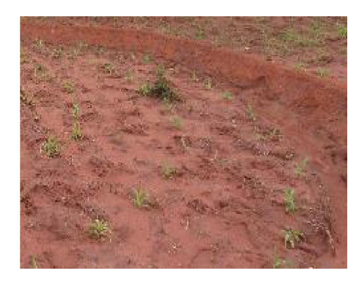
Figure 4. Earth bund built on contour line.

For maize grain and straw yields evaluation, two subplots of 5 m x 5 m = 25 \text{ m}^2 were taken in each elementary plot, in the way to avoid farm trees effect. The weight of the grain and the straw harvested on these plots were extrapolated to 1 ha to get the different yields.