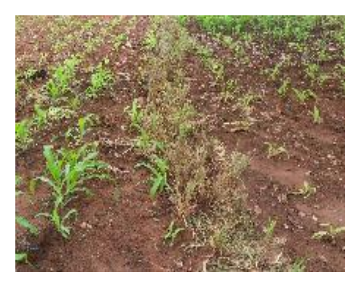
Figure 3. Grass strip built on contour line.

v) GS + Zaï + OM (5 t ha<sup>-1</sup> each two years) vi) GS + Zaï + OM + urea (100 kg ha<sup>-1</sup> in two fractions) vii) GS + Zaï + OM + NPK (200 kg ha<sup>-1</sup>) + urea