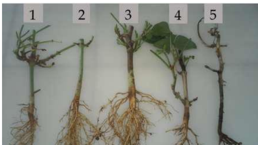
Figure 1. Brown blotch disease annotation symptoms on 1 to 5 scale.