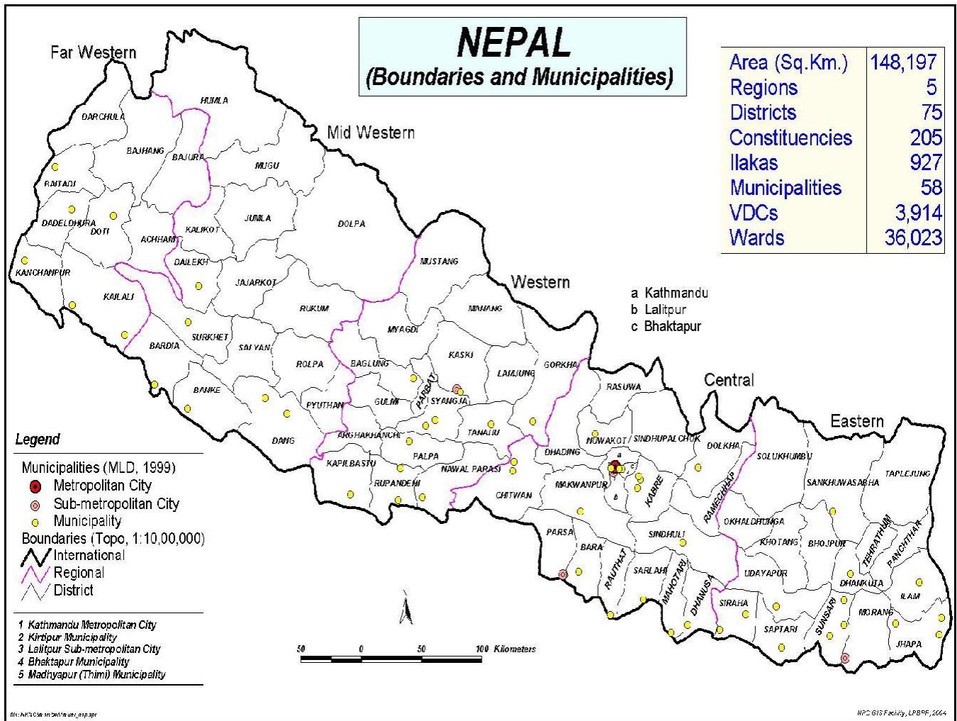
Figure 2. Current Administrative Structure of Nepal.