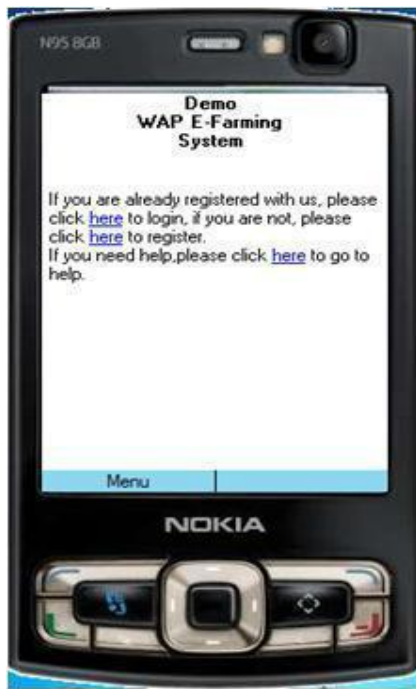
Figure 3. Main screen.