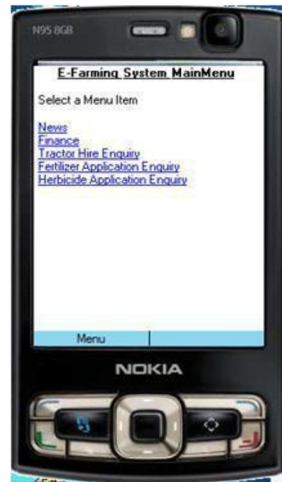
Figure 4. Main Menu screen.

Application Servers and the Internet applications when information is required from them to be passed as response to queries by either the farmers or the AEWs. A bottom-up modeling system is proposed. Using this model the farmer and his farm forms the core of the system. The farm/farmer resides in a particular locality which is part of a LGA in the State. The AEW who has been posted to that area will have direct contact with both the farmer in his locality and the LGA or State office either physically or through the computing/mobile (Internet or WAP based) platforms. The farmer also using