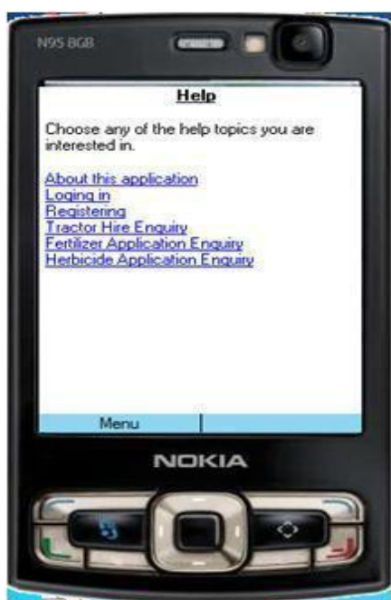
Figure 5. Help screen

activities; choice of the crops to be based on soil tests; tractor hire service; land management; pest warning and control; fertilizer use in terms of amount and timing; information on cost, profit, and risk factors for various crops; weather information; marketing and strategic planning information. The system also serves as a medium for accessing software applications, web portals, WAP and SMS application software for farmer enumeration/registration for distribution of farm inputs, application for special loan facilities etc.