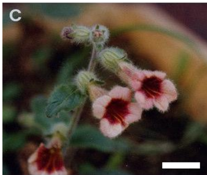
Figure 3. Plant regeneration and micropropagation of Rehmannia glutinosa : (A) initial shoot induction from leaf explants culture on MS media including 1 mg/l TDZ, (B) regenerated plant in the flask, (C) flowering regenerated plant in the green house.