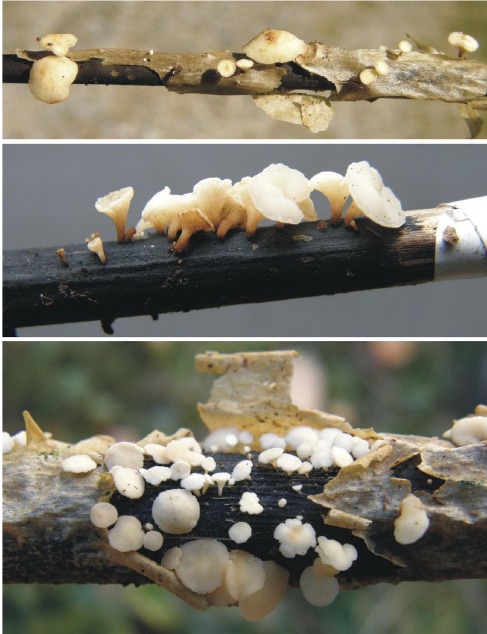
Figure 3. Apothecia of H. pseudoalbidus on F. excelsior twigs. Note black pseudosclerotial layers that had formed underneath the epidermis on each of the twigs. The size of the largest apothecial disc flats shown on each of the photos is about 5 mm.

been and still may be an important pathway to introduce the pathogen into new areas and to accelerate its spread (Kirisits et al., 2010; Timmermann et al., 2011). The occasional observation of H. pseudoalbidus apothecia on ligneous tissues of common ash indicates that nursery seedlings can indeed be infectious. It is likely that the movement of apparently and latently diseased seedlings, on which inoculum subsequently develops, can lead to the initiation of new disease centres, even far away from natural infection sources. Likewise, infected ash leaf