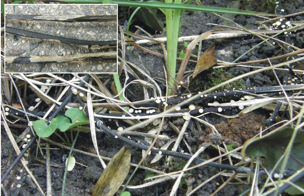
Figure 1. Apothecia of the ash dieback pathogen H. pseudoalbidus on ash leaf petioles and rachises from the previous year in the forest litter. Note black pseudosclerotial plates (see also inset) on petioles and rachises, from which apothecia emerge. Ash trees are infected by airborne ascospores produced in the apothecia.

tively small necrotic lesions in the bark), fungal isolation was attempted. After surface sterilization (1 min in 96% ethanol, 3 min in 4% NaOCl, 30 s in 96% ethanol) of stem segments, the outer bark was carefully peeled off and small discs containing wood and phloem were cut near the transition zone between necrotic and healthy phloem and placed on malt extract agar (MEA; 20 g/L malt extract, 16 g/L agar, 100 mg/L streptomycin sulphate). The primary isolation plates were at first incubated at room temperature in diffuse daylight (nursery 1, in 2008), but later (nurseries 1 to 5, in 2009 and 2011) at cool temperatures (between 4 to 10°C) in the dark. The latter was done in order to stimulate anamorph production of H. pseudoalbidus and to give it competitive advantage over other fungi, thereby increasing the likelihood to detect the ash dieback pathogen (Kirisits et al., 2009). H. pseudoalbidus was identified based on morphological characteristics of its Chalara fraxinea stage (colony morphology, phialophores and spores). Other fungi were not determined.