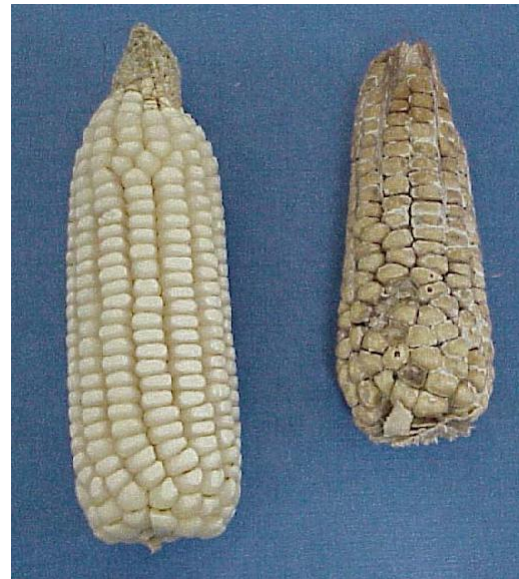
Figure 1. Apparently healthy maize cob (left) and Fusarium -infected maize cob (right).