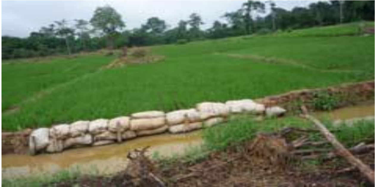
Figure 2. Sawah rice production system in the inland valleys in Nigeria and Ghana.

land. Customary land tenure systems, under which often farmers do not hold title to the land they cultivate, have been charged with failing to provide farmers with adequate incentives to adopt new technologies that could enhance production.