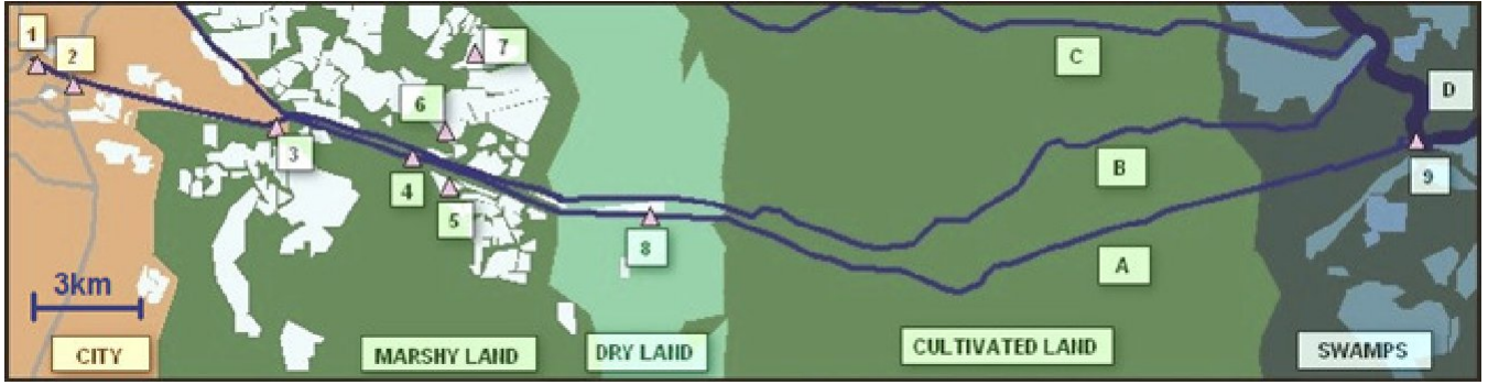
Figure 2. Sampling sites in dry weather flow (DWF) channel and the fish ponds in EKW . Sample locations: 1) Topsia, 2) Ambedkar Bridge, 3) Bantala, 4) Bamunghata, 5) Nalban, 6) Chachchria, 7) Dhalibheri, 8) Karaidanga and 9) Ghusighata. Canals and rivers: A) storm water flow (SWF), B) dry weather flow (DWF), C) Bagjola Khal (canal) and D) Kulti River.

stakeholders of the EKW (Fish Producers Association (FPA), Save Wetlands Committee (SWC), Labour Unions, etc.), supporting the sustainable livelihoods of the community without hampering ecologically balanced wetlands. The present study analyzed the impact of excess flow on the water volume of the sewage ponds based on the depth and the catchment area of the ponds, by using two neural network models. The additional sewage flow to these ponds will enhance the continued wise use of this facility. The additional sewage load in conjunction with some remedial measures to the existing channel system will potentially enhance fish production by providing additional flow (that is additional fertilizer) for the pond system. The additional sewage flow is predicted to meet WHO guidelines for wastewater-fed aquaculture and irrigation for agriculture. Discharge standards into inland waters will still be met.