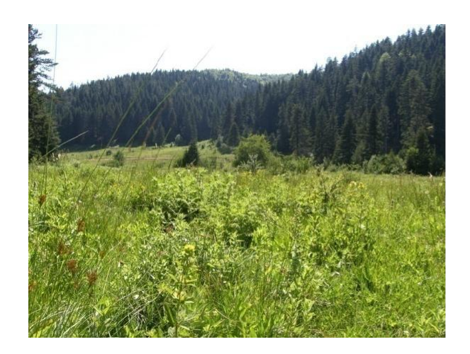
Figure 2. An example from the study areas; Uluyayla.

Order LEPIDOPTERA Suborder RHOPALOCERA Superfamily HESPERIOIDEA Latreille, 1809 Family HESPERIIDAE Latreille, 1809 Subfamily Hesperiinae Latreille, 1809 Thymelicus sylvestris (Poda, 1761) Ochlodes venatus (Bremer and Grey, 1853) Thymelicus acteon (Rottemburg, 1775)