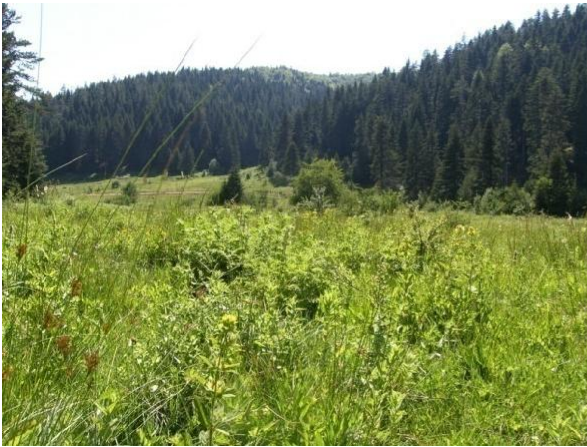
Figure 2. An example from the study areas; Uluyayla.