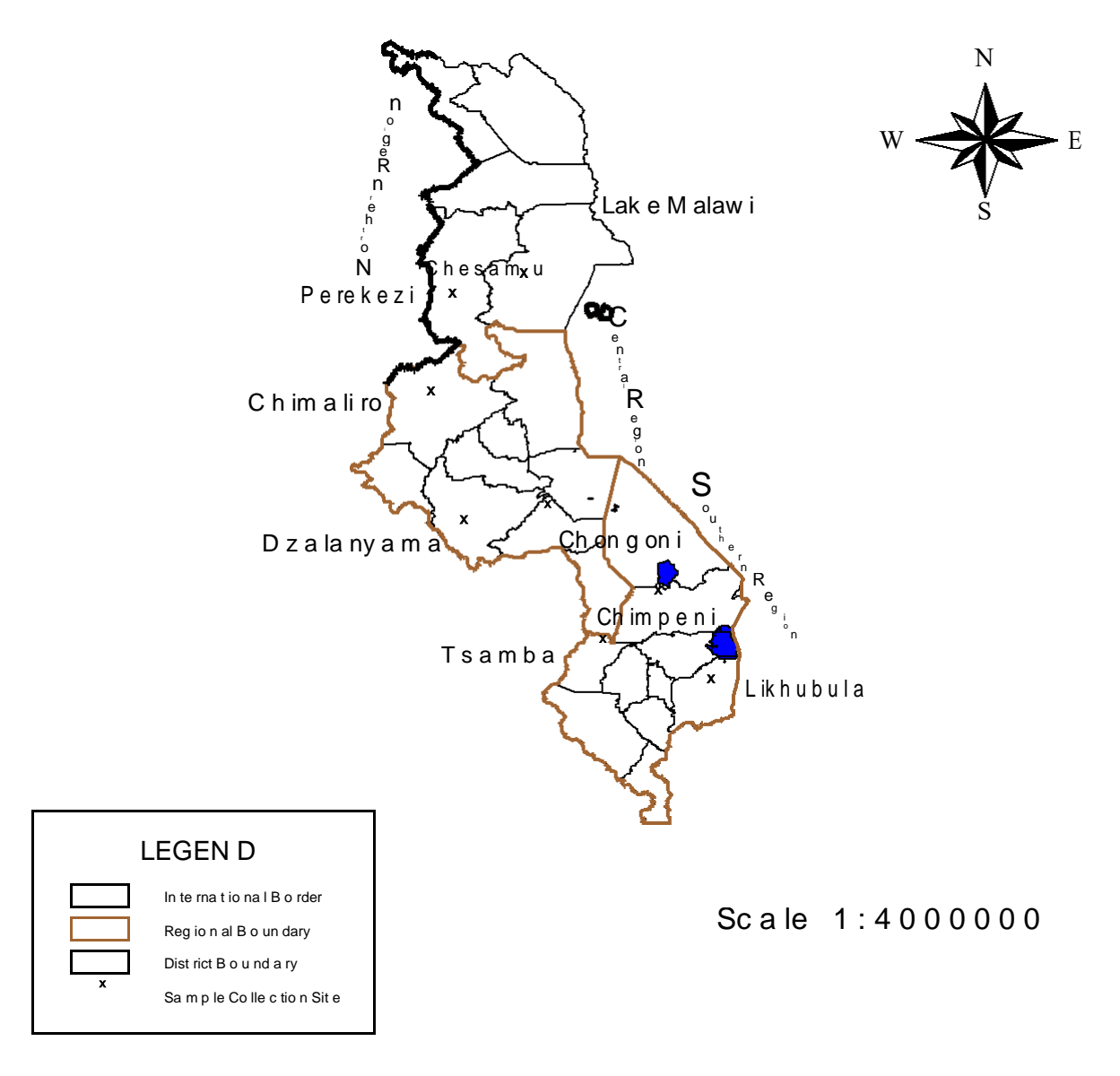
Figure 1. Map of Malawi showing location of 8 Uapaca kirkiana populations sampled from northern, central and southern regions.

in 50 ml vials. Young leaves were sampled with minimum distance between sampled trees set as 2 m to reduce the chance of sampling from sprouts from similar individuals.