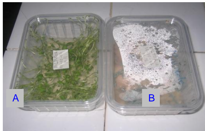
Figure 5. The oil-treated in vitro plants (punnet A, left) and non-treated vitroplants (punnet B, right).

The plantlets of potato from in vitro culture inoculated by P. infestans showed the first symptoms on the third day. These symptoms appeared as white fungal colonies on stem and leaves, the black color on stem's nodes and leaf axils due to the necrosis of infected tissues and the appearance of light spots on underside of leaves. The application of essential oils to the infected parts of the plants resulted in colony disappearance on 12 th day of