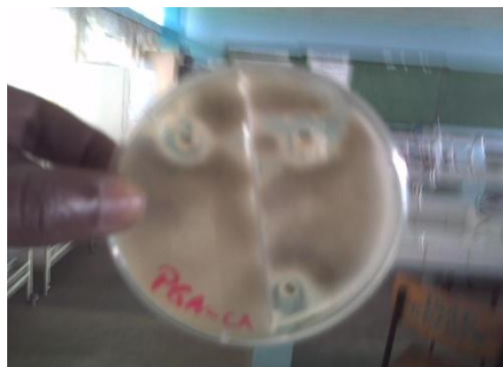
Figure 4. Inhibition zones caused by the essential oil of C. citrates .

By agar incorporation method (AIM), on the medium in which the essential oils were incorporated, the results were also meaningful. On both the cultures, the essential oils in all concentrations inhibited totally with the growth of P. infestans and no fungus colonies appeared in these cultures. In search of minimal inhibitory concentration (MIC) of each type of essential oils concerned by this study, we observed that it was within the range of 100 to 200 \mu\text{l/l} for the essential oil of O. urticifolium and 600 to 500 \mu\text{l/l} for the essential oils of C. citrates (Figures 3 and 4).