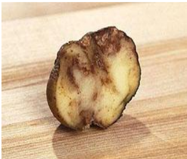
Figure 1. The sliced tuber showing symptoms of potato mildew to access the inner parts.

Pattnaik et al., 1997; Fontem et al., 2004). This last is known as the phenomenon of bio-accumulation (Hilan and Sfeir, 1998). Even with low dose, the presence of the toxic substances in the environment can represent a danger to the living organisms through the food chains. These last years, this challenge disputed the use of chemicals in plant diseases control and led the scientists to direct their research towards other alternatives. From then on, the use of the bio-pesticides has been promoted for integrated management since many chemical fungicides do not by themselves afford satisfactory levels of control. However, the use of microbial control in agriculture presents a great danger to non-targeted insects (Bernardo et al., 2008). As for the plant-based pesticides, the studies succeeded to combat various kinds of diseases and pests. They are abundant in nature and their use respects other species of organisms in the ecosystem. Among them, the essential oils are being tested in Rwanda by Institute of Scientific and Technological Research (IRST). These essential oils are actually the mixtures of more or less many components that, alone or in synergy, impart to these oils the biocidal properties (Hilan and Sfeir, 1998; Fontem et al., 2004; Kakana, 2005).