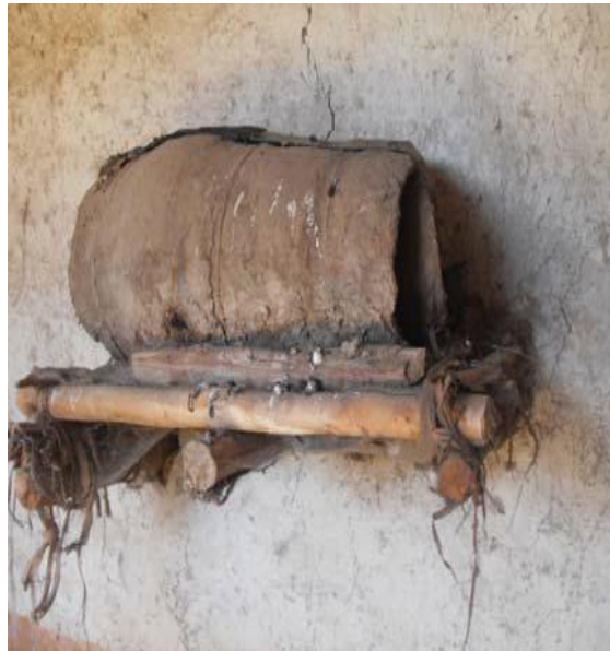
Figure 2 (b). Traditional beehive.

where L_T - likelihood for the tobit model; L_P - likelihood for the probit model; L_{TR} - likelihood for the truncated regression model and k is the number of independent variables in the equations. If the test hypothesis is written as;