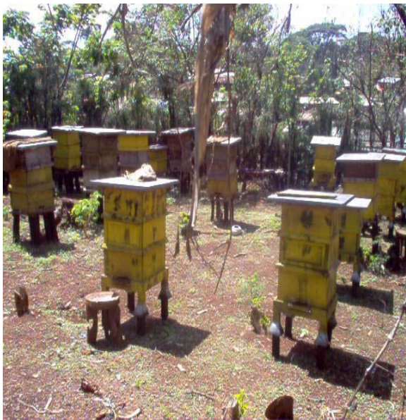
Figure 2 (a). Improved box hive.