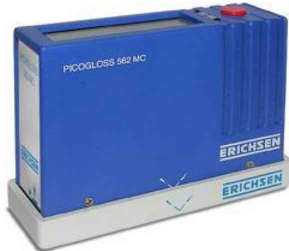
Figure 5. Glossmeter.