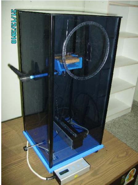
Figure 3. König pendulum hardness.