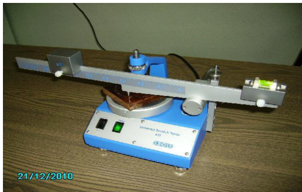
Figure 4. Scratch resistance.

cleaned by brush, considering the recommendations of the manufacturer company. Dye has been applied as 3 layers for boards coated with paper and as 5 layers for board uncoated with paper (Cakicier et al., 2010).