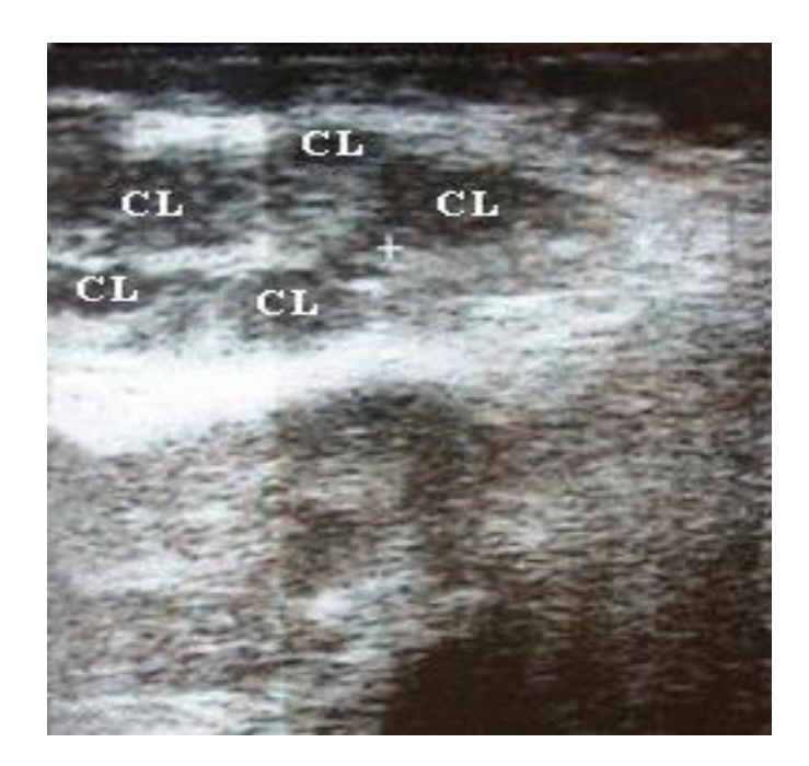
Figure 2. Corpora lutea present on superovulated ovary. CL: corpora lutea.(Toshiba Echography SONOLAYER-L SAL32-B, linear sound of 5 MHz)

Results of superovulation treatments, reported in Table I, show that all donors came into estrus in a mean interval, PG- onset of estrus of 39.5 h after Luprostiol injection, with an average number of corpora lutea per cow, present on the day of collect of 7.5 Our results show that "Cheurfa" breed donors responded to treatment of superovulation and have no variability in the time of onset of their estrous. The mean interval PG-early observed