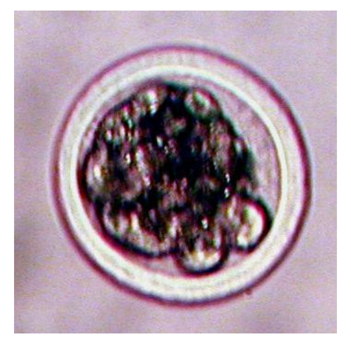
Figure 4. Morula stage (x 100). a : zona pellucida, b : blastomere.

et al. (1986), which were respectively of 6.5 and 6.9, with a lowest dose of pFSH for "Baoulé" cows breed. However, it is higher than those reported by Diop et al. (1994) and Jordt et al. (1986), which were respectively of 5.06 and 4.5, with a lowest dose of pFSH for "N'dama" cows breed. Elaidi et al. (1996a) have obtained a biggest response to treatment for "Oulmes Zaer" cows breed, when