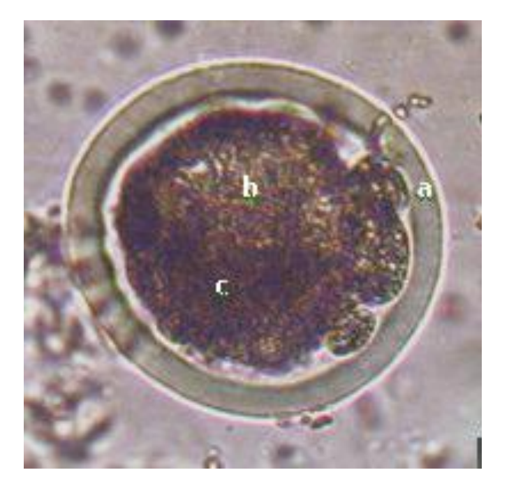
Figure 3. Early Blastocyste (x 100). a : zona pellucida, b : blastocoel, c : Inner cell mass.