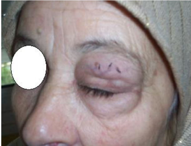
Figure 1. Left orbital mass.