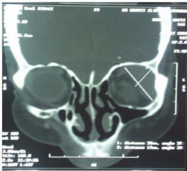
Figure 2. Orbital process with extension to the lacrimal glands and the upper eyelid.