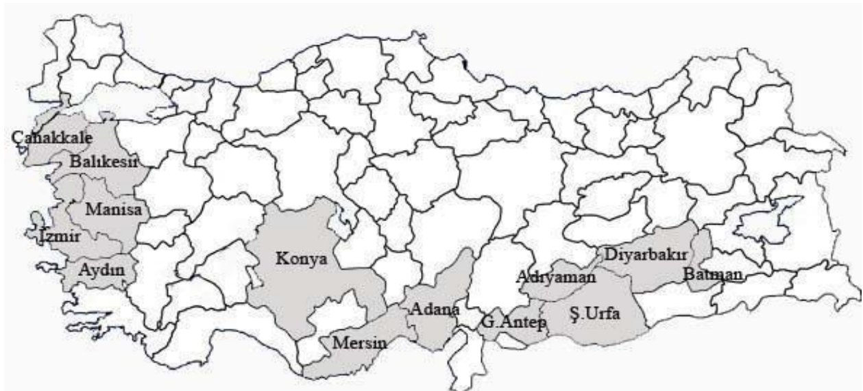
Figure 1. Surveyed provinces for watermelon wilt in Turkey.

* Numbers in parenthesis show the numbers of surveyed fields for corresponding provinces. ** Numbers in parenthesis show the numbers of surveyed fields having wilted plants ( V. dahliae + / -) in corresponding location.